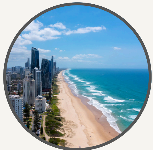
SURFERS PARADISE / BROADBEACH