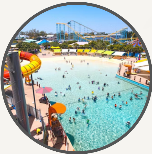
DREAMWORLD / WHITE WATER WORLD

There's so much to experience on the Gold Coast! We've put together a few ideas below to help you make the most of your visit.