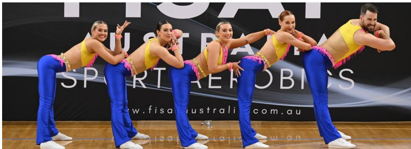
Shake – Action Sport Aerobics & Capital Aerobic Academy, VIC (2023 National Championships)