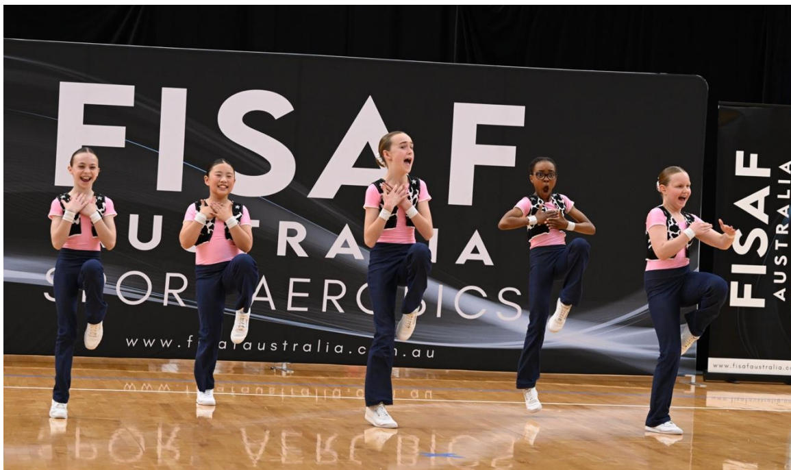
Linden Rodeo – Linden Park Sport Aerobics, SA (2023 National Championships)