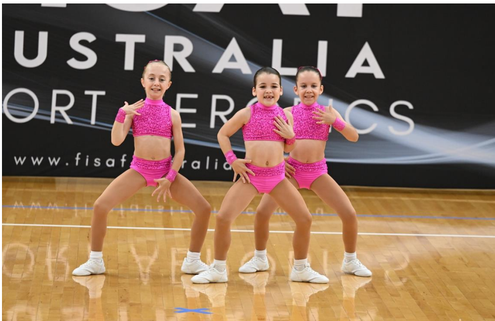
Spice Up Your Life – DBBC Sport Aerobics, QLD (2023 National Championships)

Forward/ Backwards walkover variations: A gymnastics move where the athlete starts on one foot travels their body through an inverted position to land on the ground. Athletes must not land upright unless supported by teammates. At least one hand must be in contact with the floor when completely on your own. No flick.