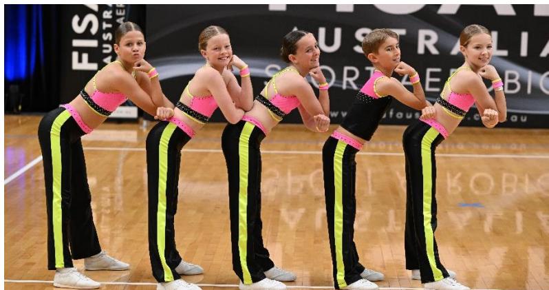
Freaks – Industrie 1 Sport Aerobics, SA (2023 National Championships)

Fitness choreography can be enhanced by the use of formations, vertical levels, a variety of leg levels, and creative use of kicks and jumps to enhance the visual effect of the routine. Group lifts are permitted to use with/for the start or end pose only.