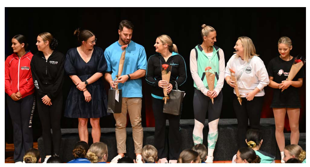
Judge Appreciation Presentations at the 2022 National Championships

It's been a great start to 2023 with all judges participating in an online judging course freshly designed for both new and existing FISAF Australia judges.